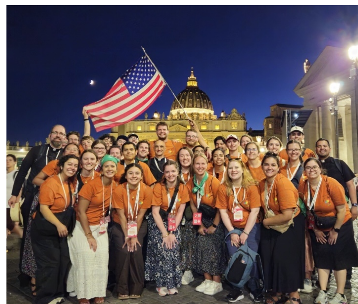
Diocese of Joliet young adult pilgrims in St. Peter's Square after the opening Mass for the Jubilee of Youth.